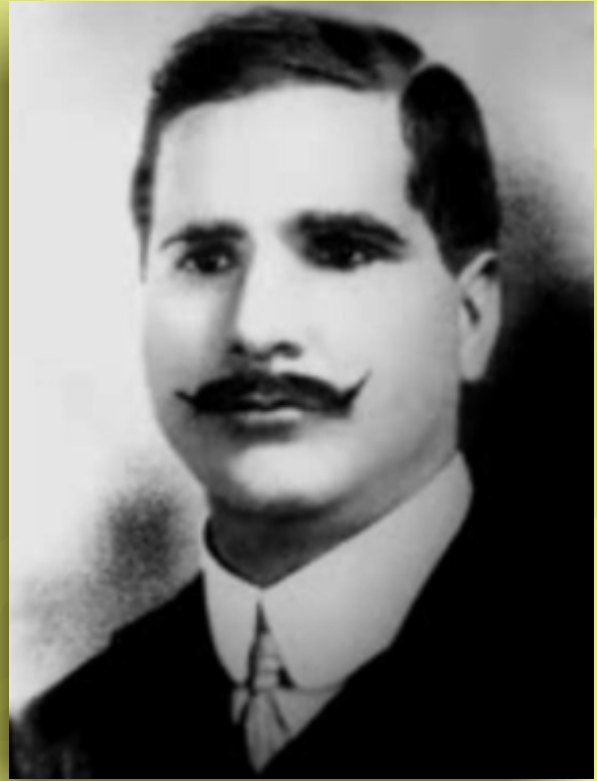
Dr. Allama Muhammad Iqbal The Great Philosopher / Poet of the East

People who have no hold over their process of thinking are likely to be ruined by liberty of thought.