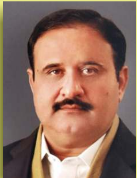
Sardar Usman Ahmad Khan Buzdar Chief Minister, Punjab