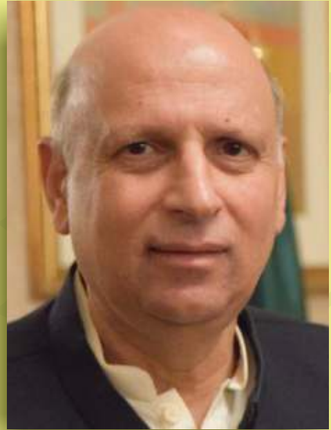
Chaudhary Muhammad Sarwar Chancellor / Governor Punjab