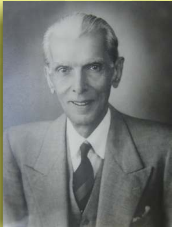
Quaid-e-Azam Muhammad Ali Jinnah Father of the Nation

I think the Muslims will be the strongest and stablest element of the future Government of our country and if they are organized they will make an even greater contribution to the freedom of India than any other community. He advised the students not to take part in active and aggressive politics of the country but to keep abreast of what was going on in the country and the world around them.